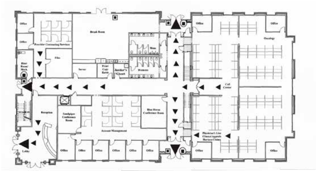
1ST FLOOR - 15,575 SF