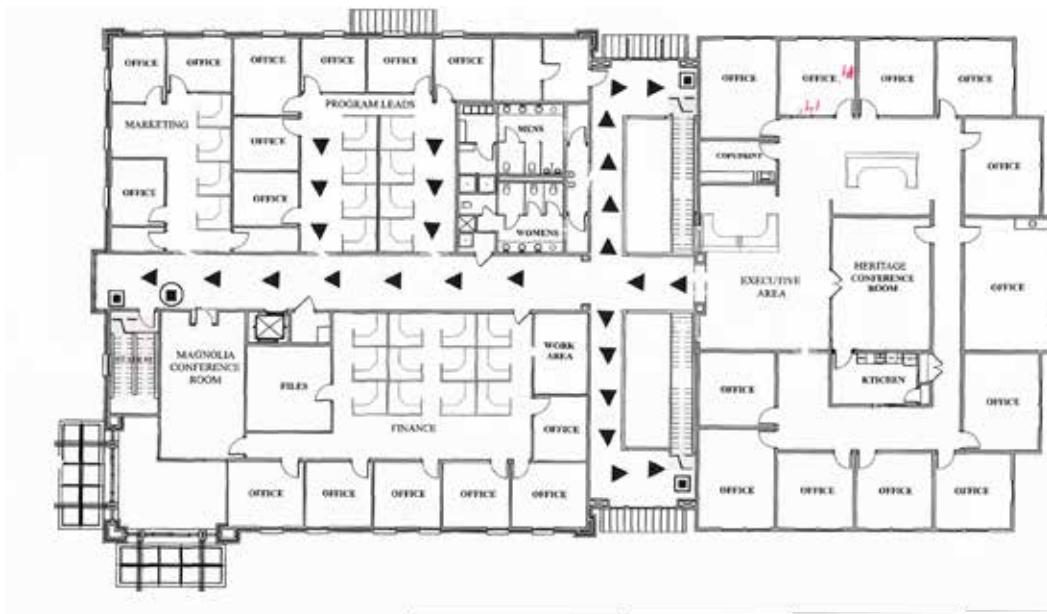
2ND FLOOR - 15,575 SF